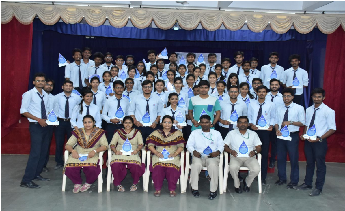
Staff and Student members after taking Water Conservation Pledge