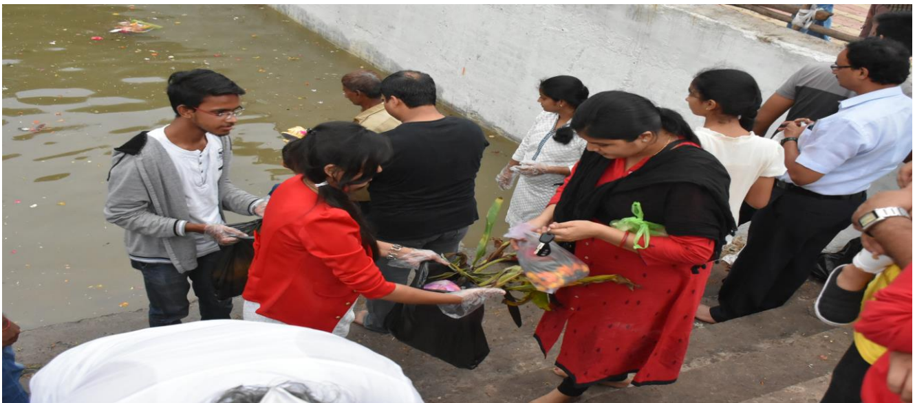
Student Volunteers collecting Nirmalya from public during Immersion