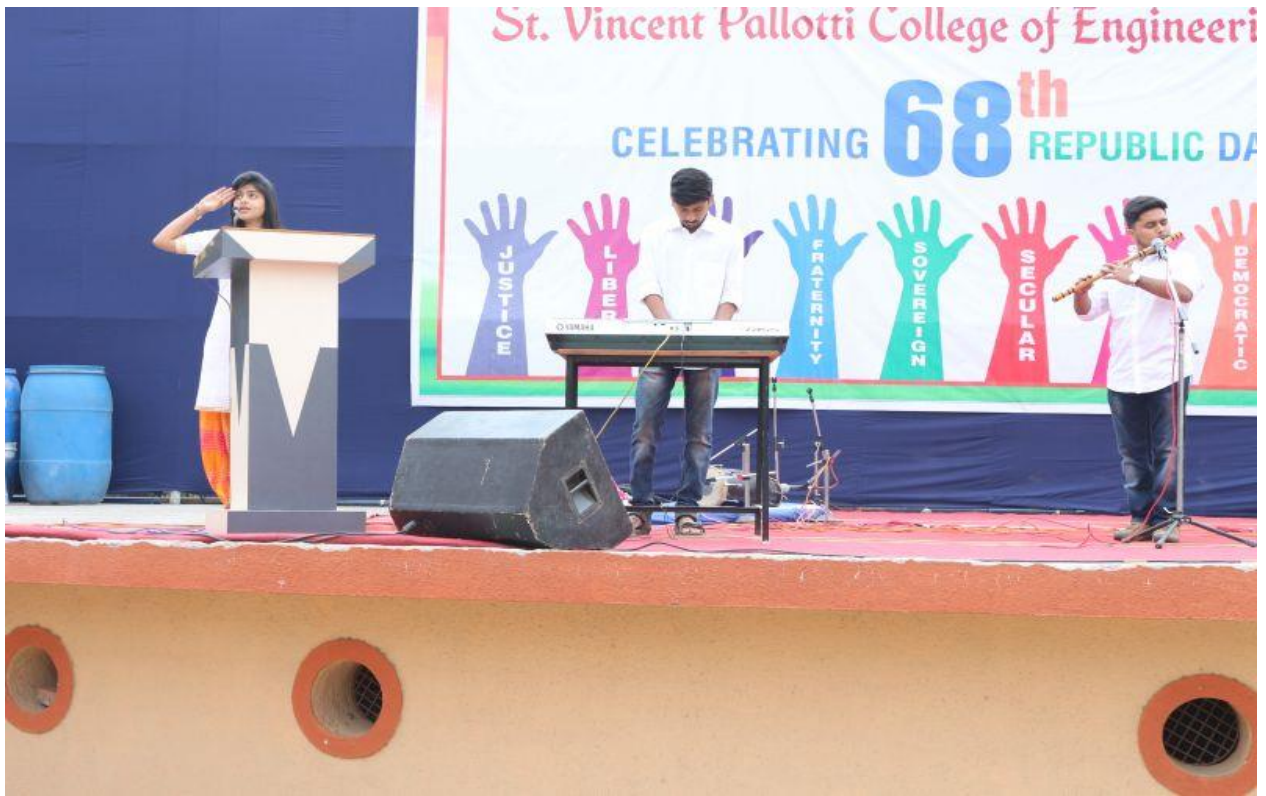
Student performance during event