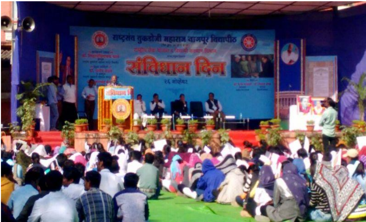
Gathering at RBI Square for observing Indian Constitution Day