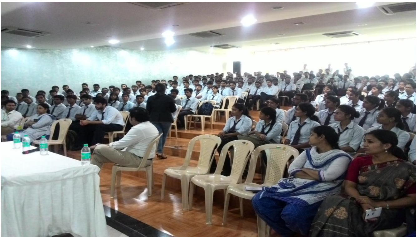
Student Volunteers Along with Faculty Coordinators Present during Presentation on Teach For India