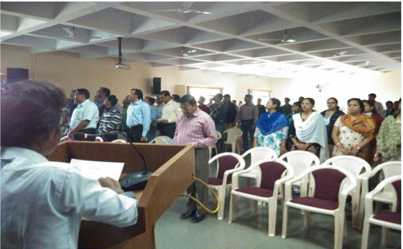
Staff and Students Reciting Indian Constitution Preamble