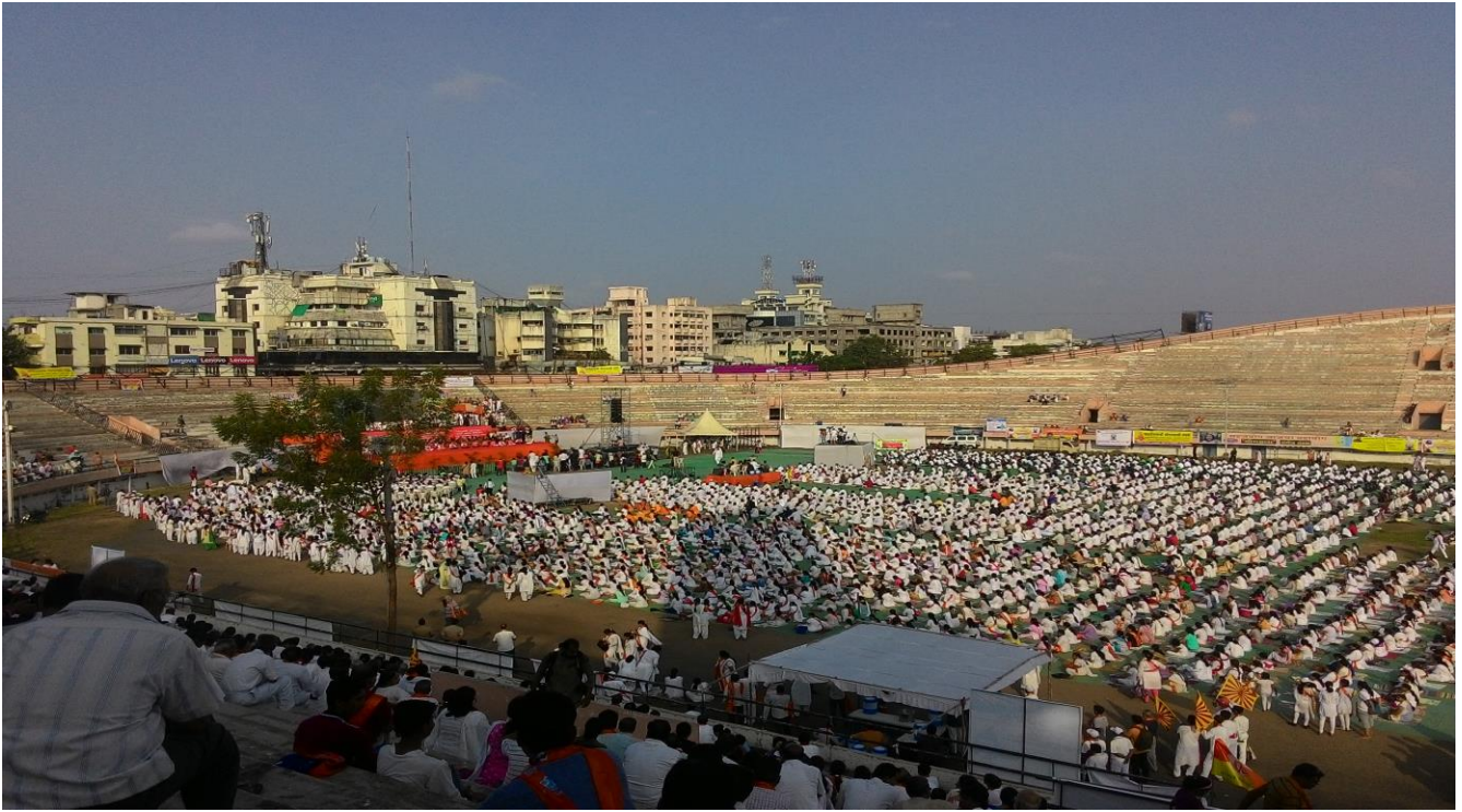
Participant Performing Yoga