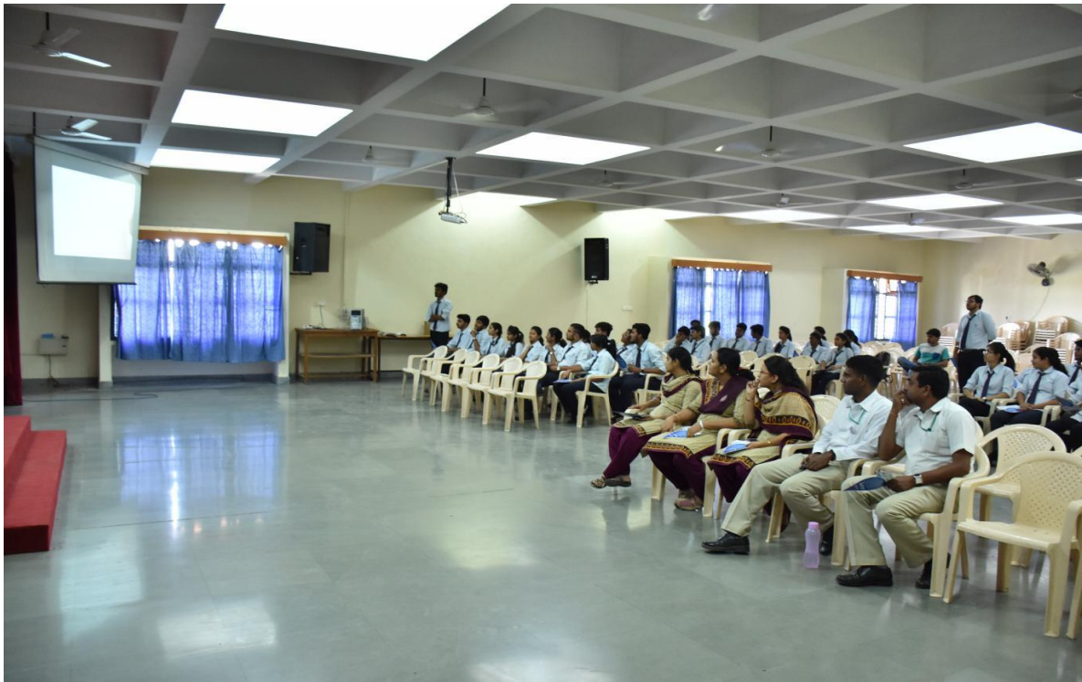
Students and Staff Members gathered for Water Conservation Pledge