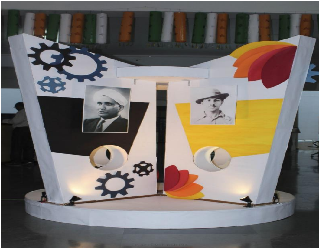
Preparation during Celebration