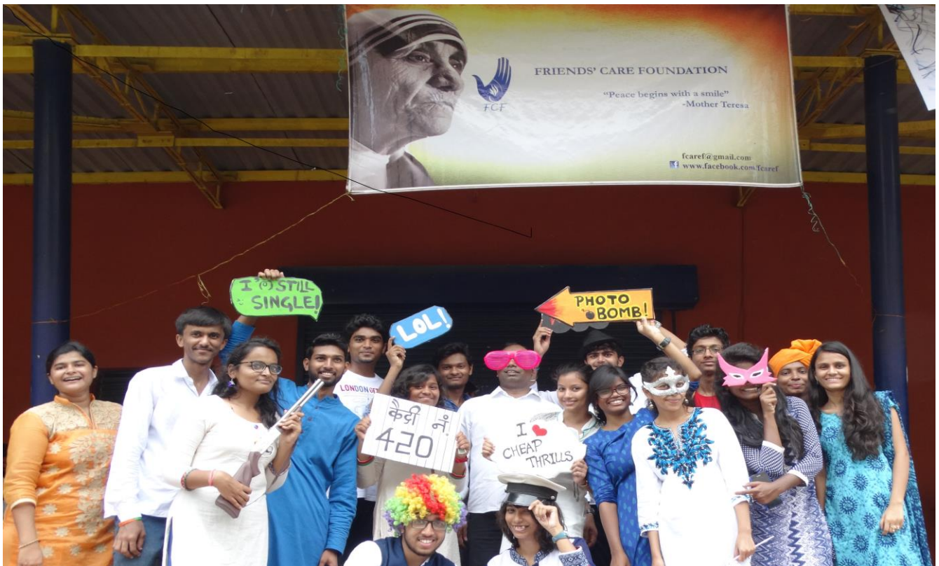
Student Volunteers behind the Success of this event