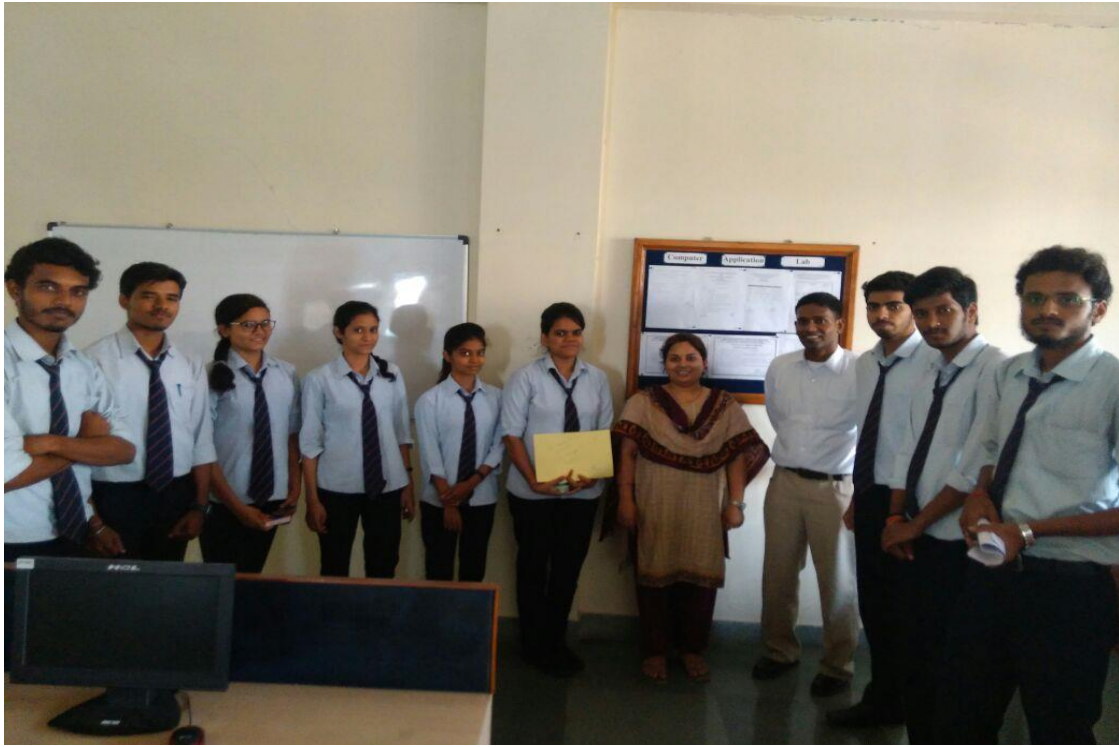
Mechanical Department Celebrates International Women's Day