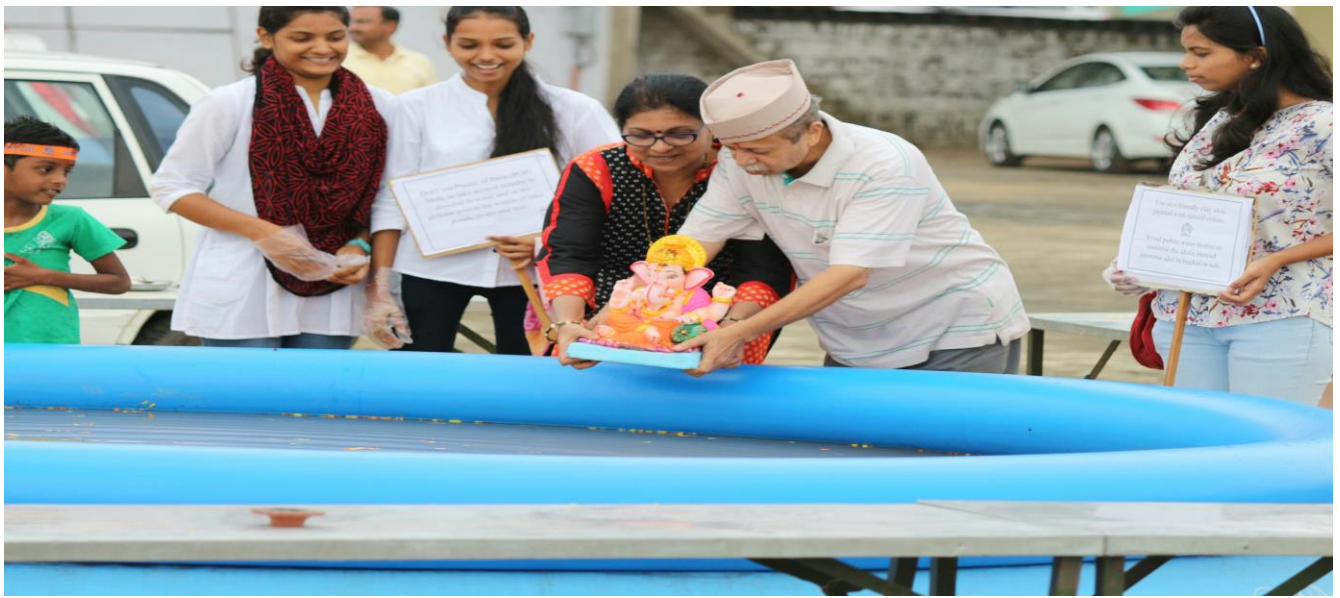
Student Volunteers helping peoples during immersion