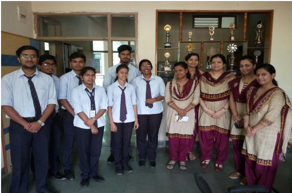
Electrical Department Staff Members with NSS Student Volunteers