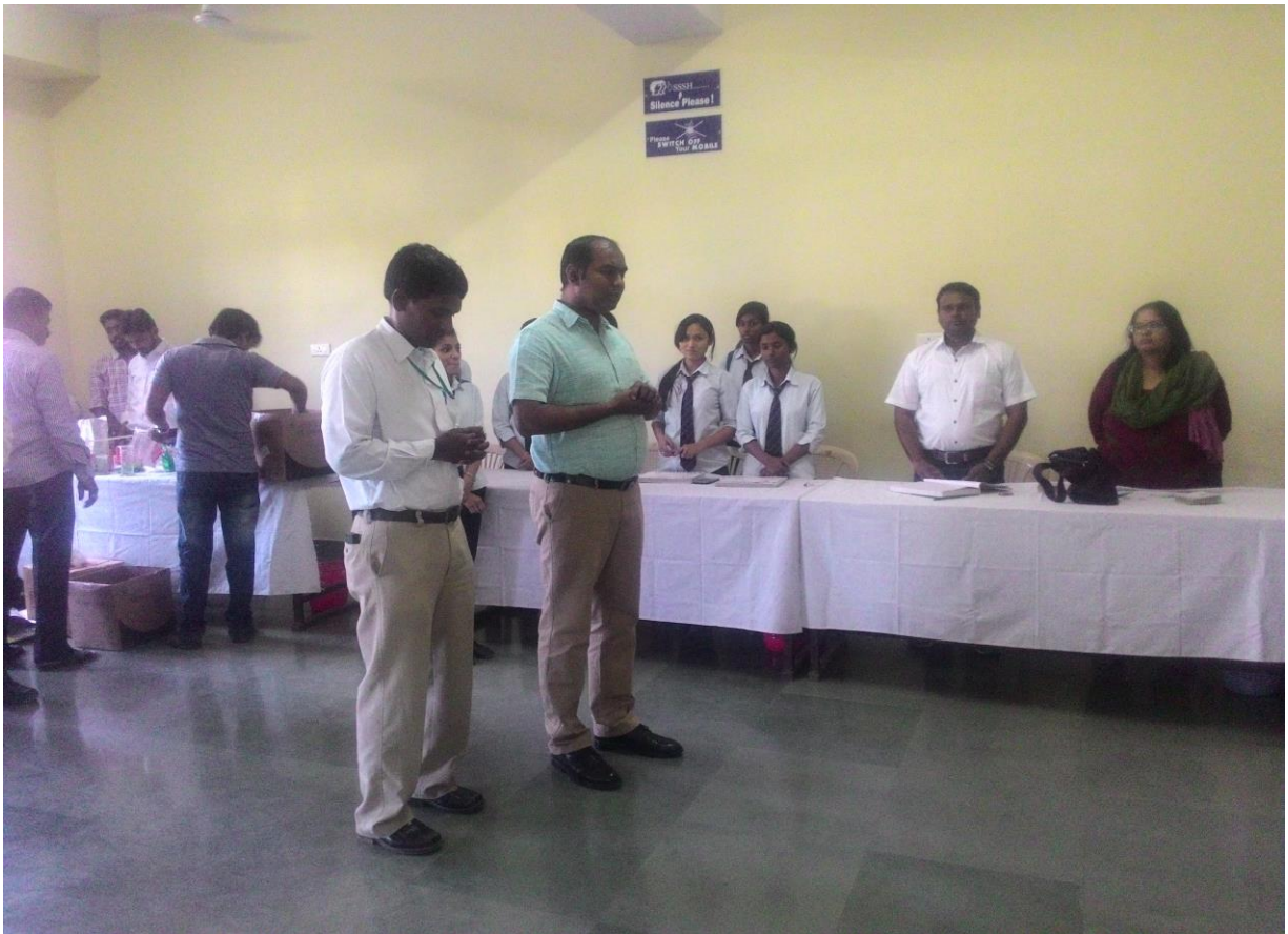
A prayer before start of Blood Donation Camp