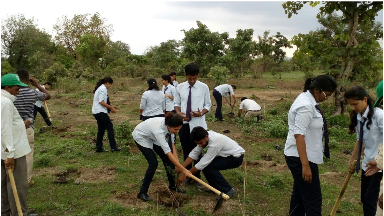
Students doing Tree Plantation