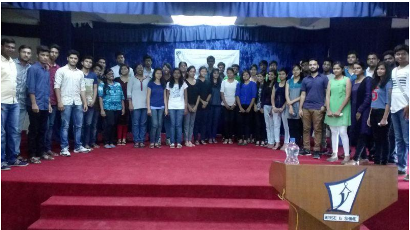
Participants of Guest Lecture