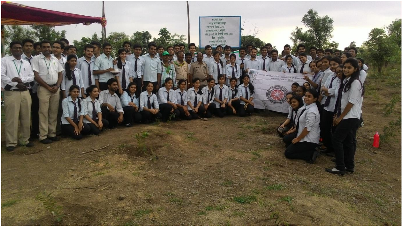
Faculties & Student after Tree Plantation Drive