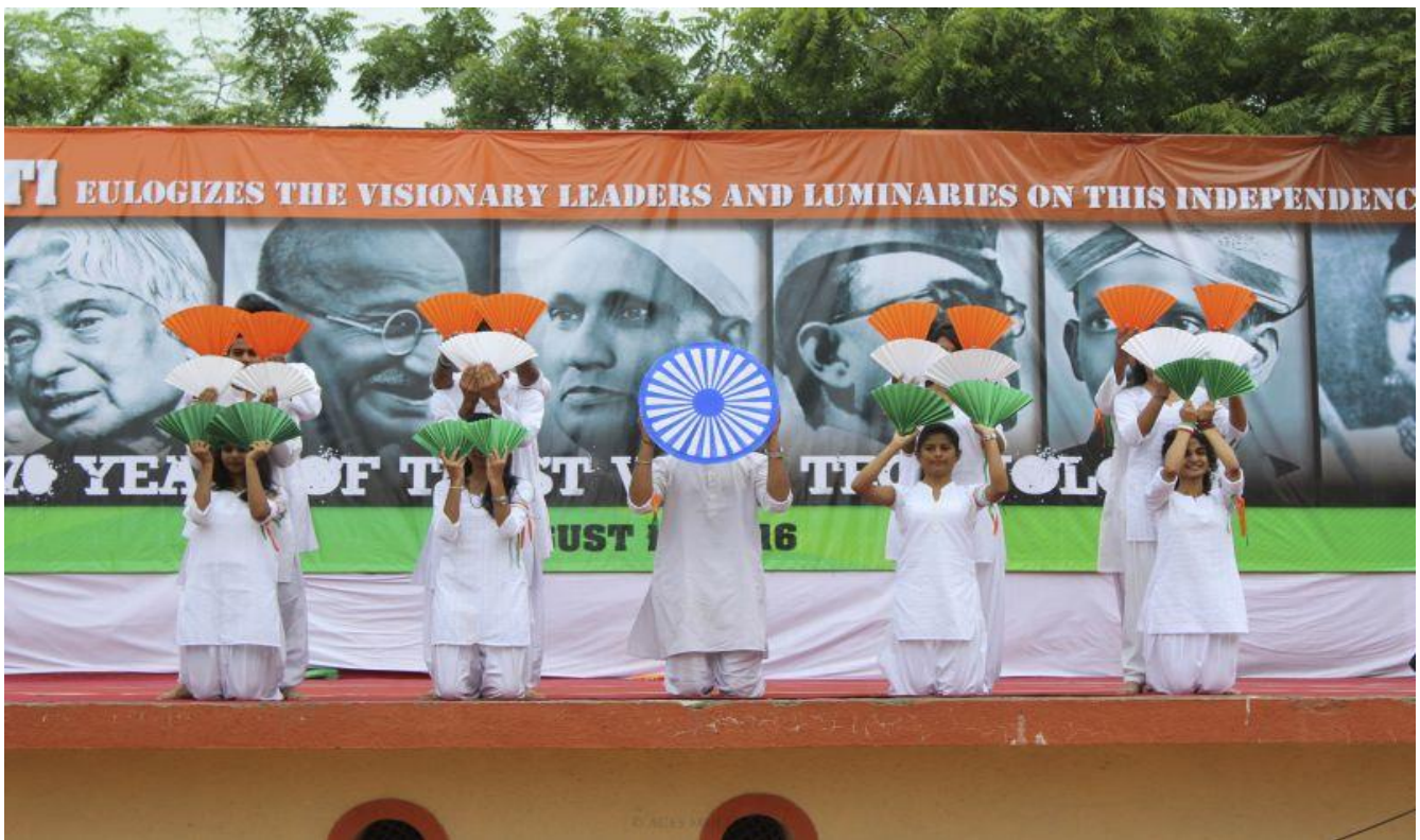
Students performing Patriotic Melodies