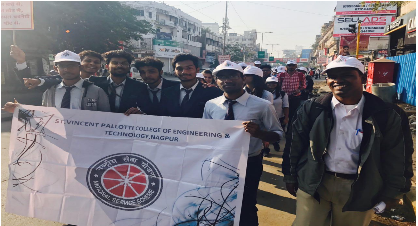
Staff and Students during National Voters Day Rally