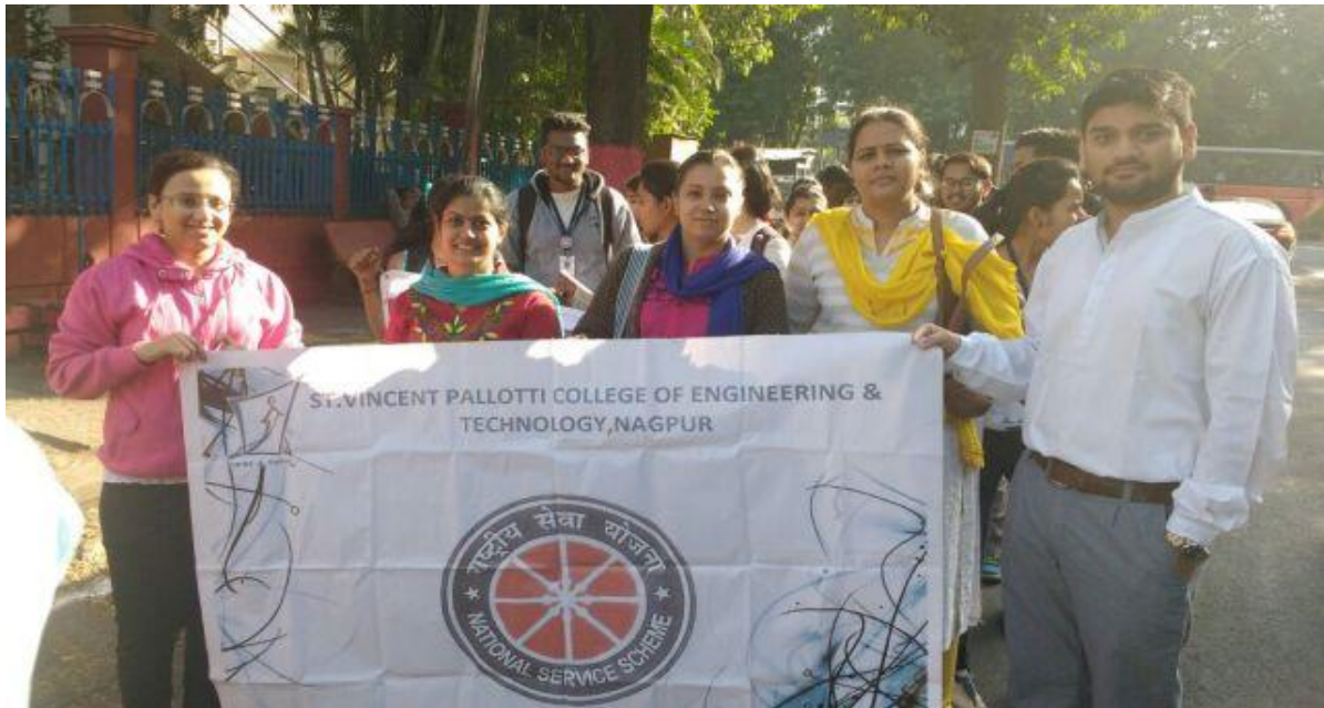
Staff & Students of SVP CET at RBI Square during Participation in Program organized by RTMNU