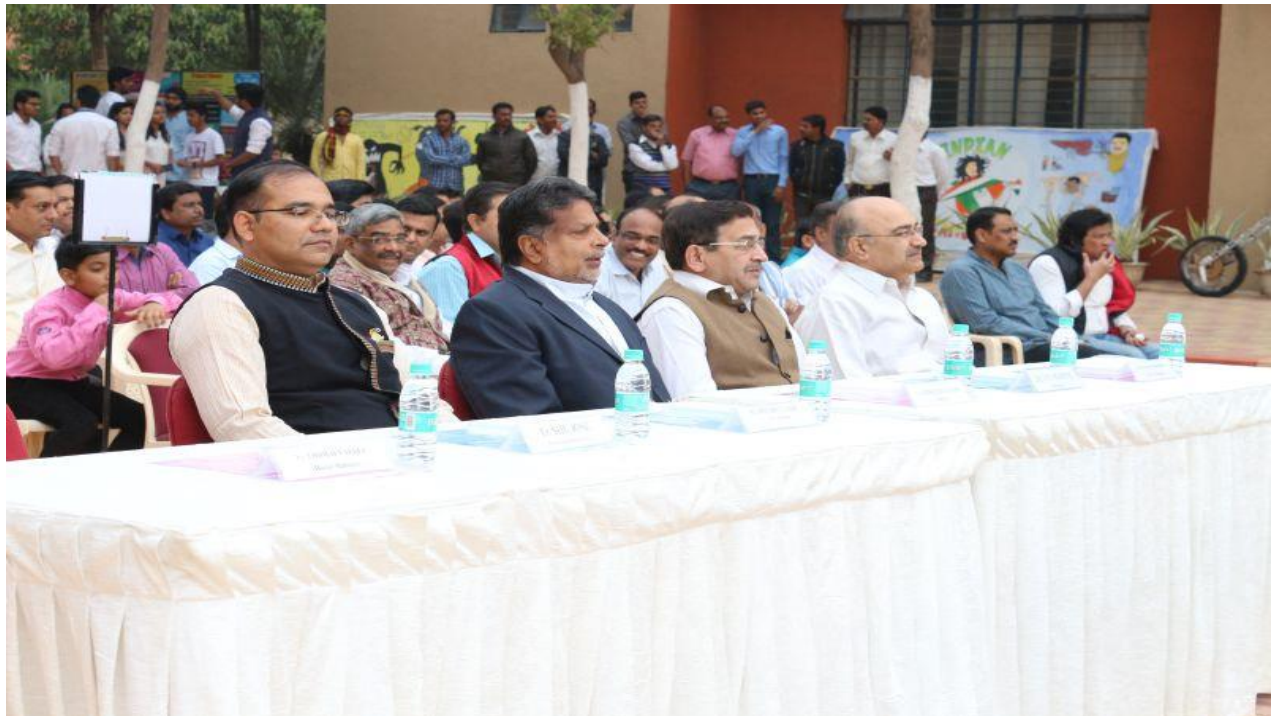
Dignitaries and other staff members look upon