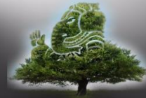
Photo of Flex Banner made for creating awareness

Do Eco-Friendly Ganapati Immersion! Save Your Planet! Save Nature!