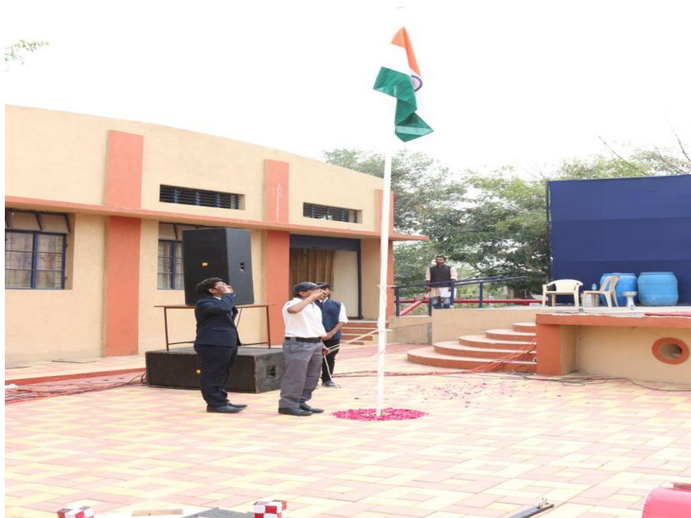
Flag Hoisting done by the Guest of Honor