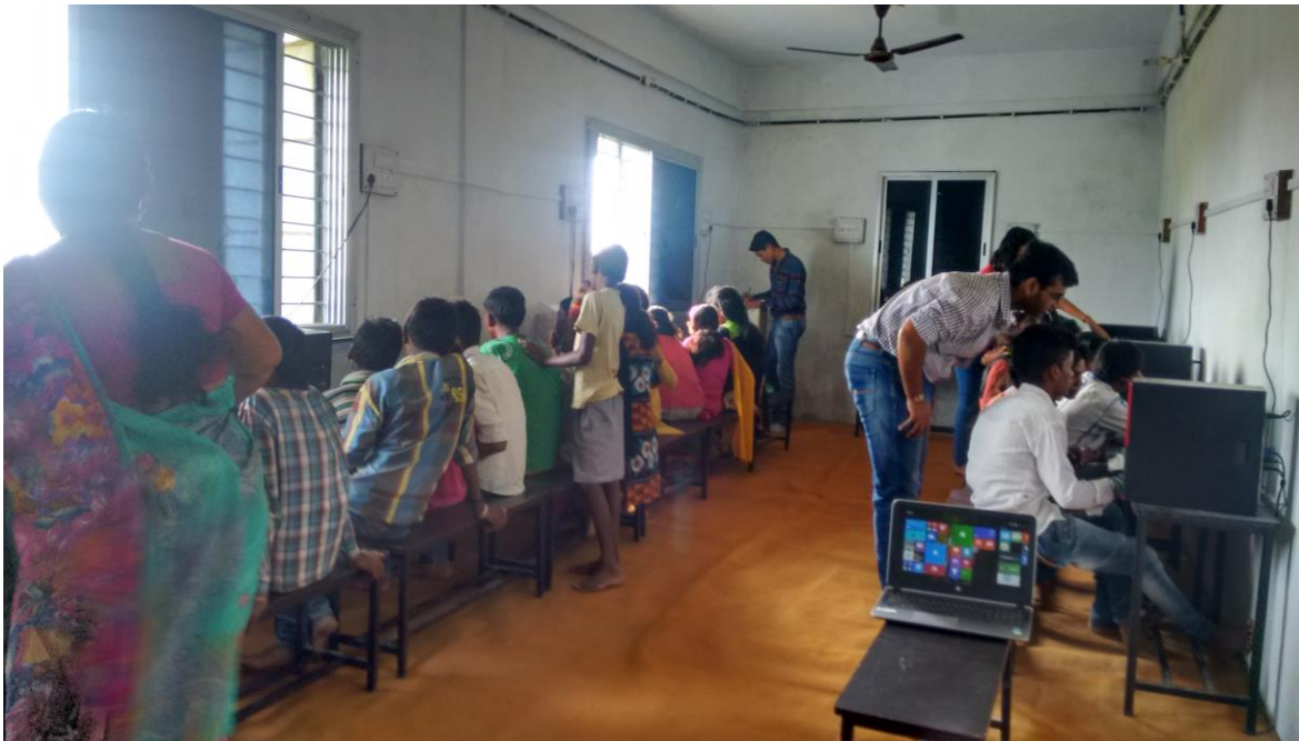
Computer Learning made Easy to Students of Ashram School