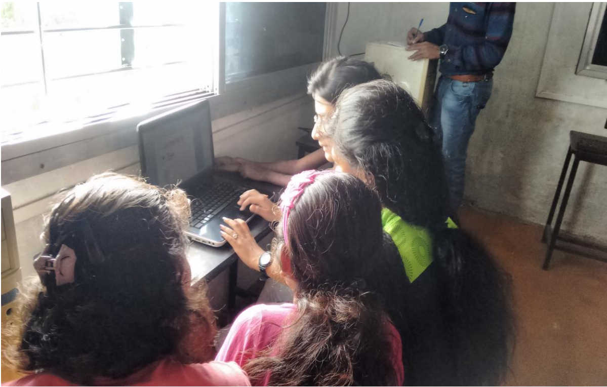
NSS Student Volunteers teaching Ashram Students