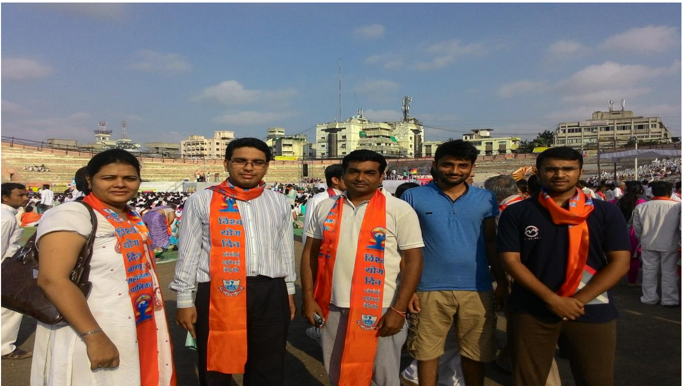
Yoga for Harmony & Peace