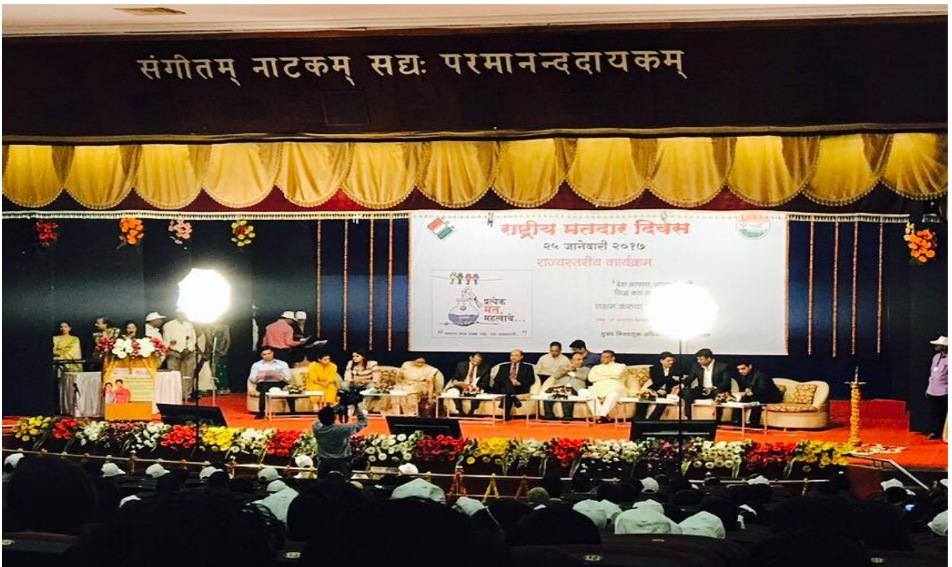
Gathering at Vasant Rao Deshpande Hall to observe observing National Voters Day